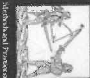
Methods and Practice of Elizabethan Swordplay Copyright © 1990 by Tony Soper